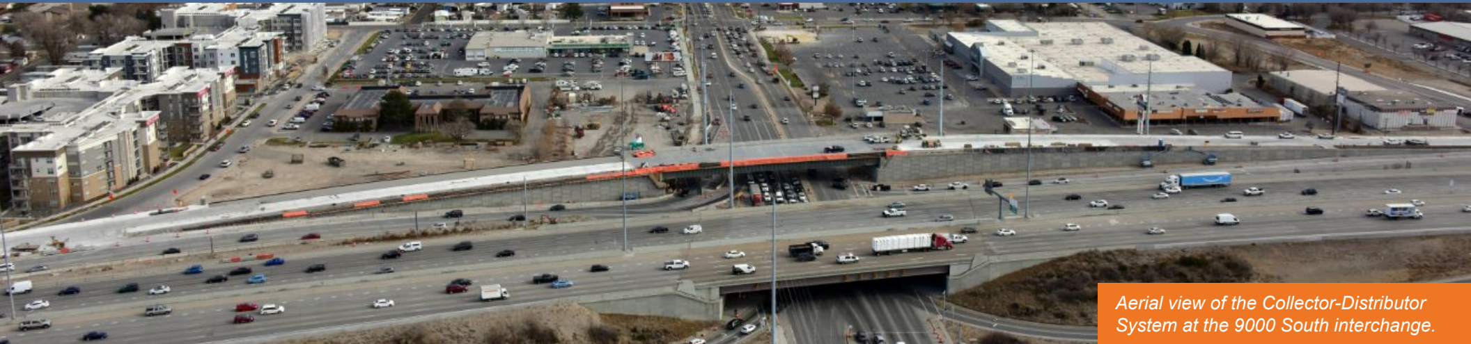
Aerial view of the Collector-Distributor System at the 9000 South interchange.